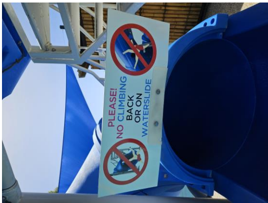
Pool Slide Sign