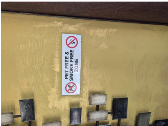
Pet & Smoking Free Area sign