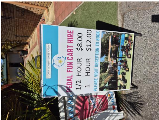
Pedal Kart Sign