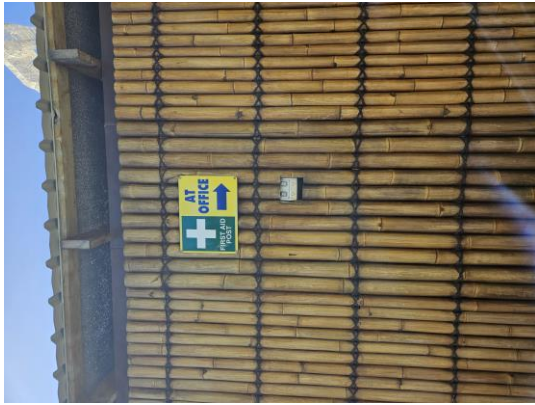
First Aid Sign