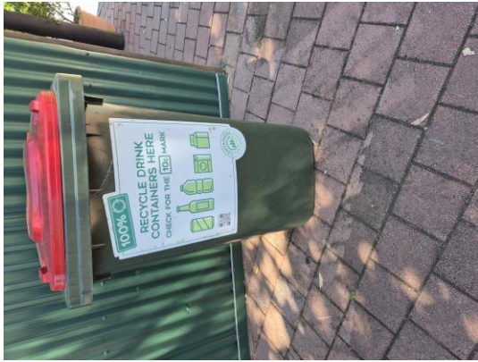
Recycling Bin Sign